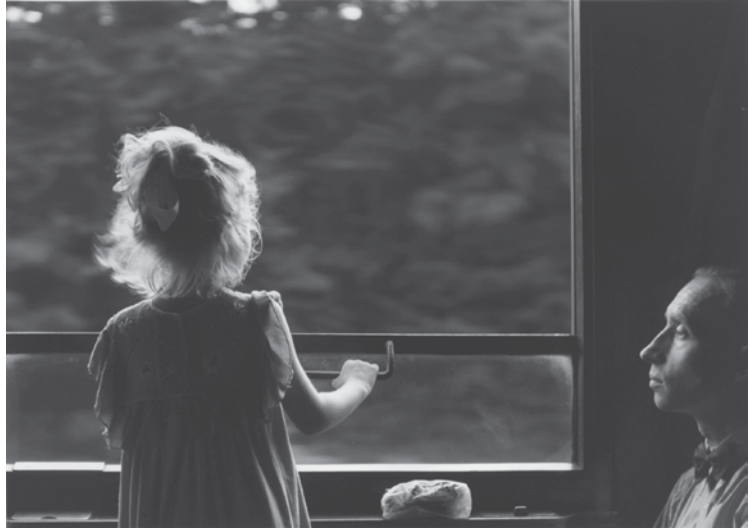
The Orient Express 1952 Ira H. Latour