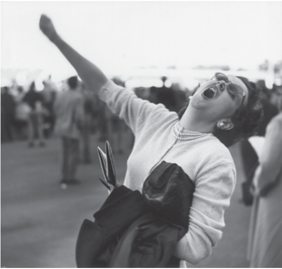
Bay Meadows Racetrack, CA 1949