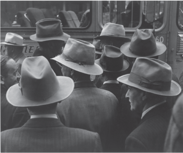
Hats Seattle, Washington 1951